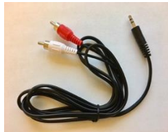
RCA to 3.5mm cord

An AUX IN/auxiliary jack (3.5mm) input is provided for connecting external devices such as LCD TV, CD / DVD player, iPod.